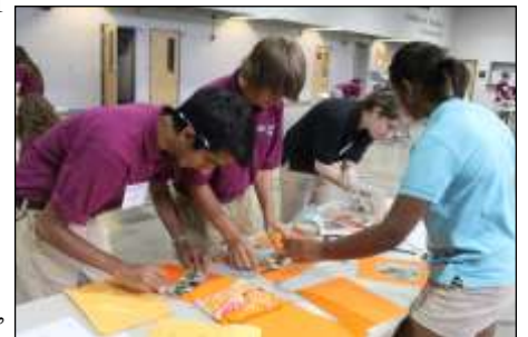
UthMpac came in October and created language arts activities to last all year.

I have the privilege of working with lots of kids, getting to teach them about God's word, encouraging them to achieve, and equipping classroom leaders and volunteers to help students grow in all areas. If that isn't enough, God has given me relationships with many of my students' moms. Together we fight for the success of our students, advocating with and for our families. I can't imagine living, working, or raising my kids in any other place.