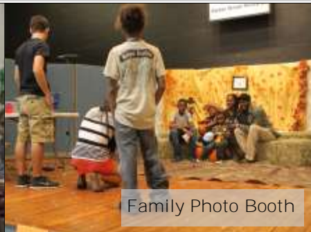
Family Photo Booth