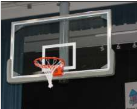
March Madness came early with installation of retractable basketball backstops, courtesy of the Kivwanis Cares for Kids Auction.