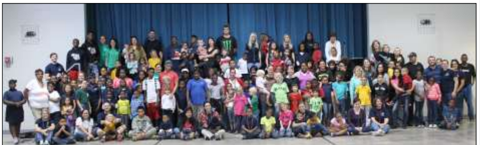
What a group of students and parents!

christina (at) parkerstreetministries.org