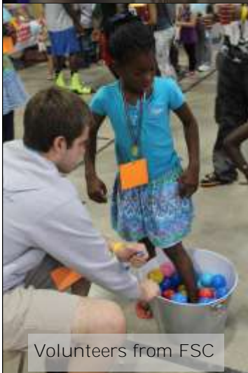
Volunteers from FSC

Fall Festival More Photos Even though we moved inside because of the weather, we had a great time with the first ever family photo booth, new games (thanks to Florida Southern College’s Sigma Chi fraternity), and snacks. It was the BEST CANDY YEAR EVER . Thank you to everyone who brought in your leftover candy from October!! And thank you to the volunteers who pulled together to make Fall Festival happen!