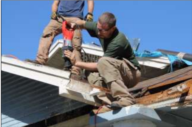
Peachtree renovation project with new Milwaukee Sawzall.

Life around the Parker Street neighborhood is always interesting and brings new challenges. The trick is to be able to grow and learn from the experiences that we face so that we are better equipped for the next time something happens. Over Labor Day weekend, someone decided that it would be a good idea to break into our job site trailer and steal all of our tools and small supplies. It was as if they connected a vacuum to it and sucked it clean! The trailer was parked across the street from my home, next to one of the houses we are renovating, and it was well secured. Initially, I felt angry, frustrated, and violated. How could this have happened to us? Later in the evening, a dear friend reminded me of Matthew 5:43-47: