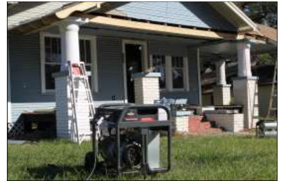
Check out the new generator.

In releasing my attitude and our belongings to the Lord, He has proven faithful to provide what we need right when we need it. Right away I received gifts of money toward new tools. We had friends dropping off tools at our house and offers to lend me anything I needed. Through a connection with an online tool magazine called Pro Tool Reviews , we were able to replace nearly everything with newer and better models than what was lost. Looking back, it gives me goose bumps to think of how the God of the universe cared so amazingly well for us in what was perceived as such a loss. I am humbled by the generosity of the community and the wonderful friends and neighbors we have here.