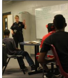
LPD Chief Womack visit