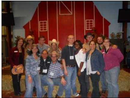
Staff and Friends at Barnyard Bash