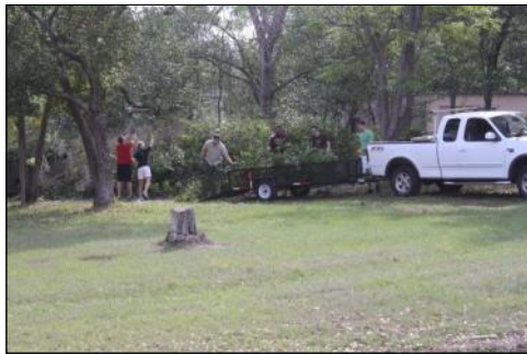
Properties cleared: 20 Dumpsters filled: 12

In March, we were blessed to work with 27 college students from His House Fellowship at Central Michigan University who dedicated three days of their spring break to Parker Street Ministries. These students tackled a number of projects around the PSM campus and out in the neighborhood. In the community we did a major deep cleaning that involved not only picking up trash but also clearing brush, cutting down