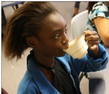
Learning the etiquette of pinky positioning

In addition to academic gains, AEP students have experienced new extracurricular activities. All of our students, kindergarten-8th grade, have opportunities to create their own art masterpieces through our continued partnership with Polk Museum of Art. We are looking forward to the third publication of the Teen Zine , a compilation of the middle school and high school students' work. Additionally, our students have participated in dance classes, Girl Scouts, sports, and life skills.