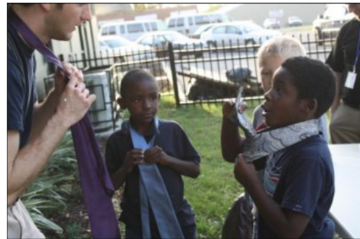
Extracurricular day at AEP

This year we have been able to serve nearly 80 students. It is exciting to see the progress that our students have made academically. AEP staff have worked tirelessly to meet the needs of each student in their classrooms. Volunteers have shared their lives and time by providing small-group and individual academic help. This has truly meant success for our students. Students are moving from an attitude of “have to” to “want to” when it comes to schoolwork and learning.