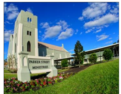
Winner of April's Beautification Award from City of Lakeland.

Parker Street Ministries serves residents in these boundaries: In-Town Bypass to the south, Memorial Boulevard to the north, Florida Avenue to the west and Ingraham Avenue to the east.