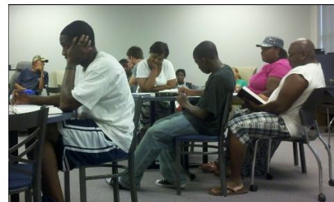
Adult Bible study group continues to meet weekly

Ben can be reached at ben@parkerstreetministries.org .