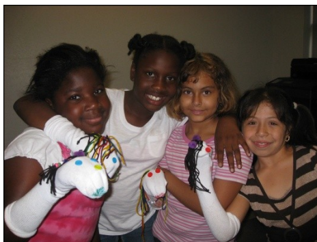
Sock Puppet Day

God always keeps his promises; this was the theme of our elementary Bible curriculum this summer. This amazing truth was so evident during our sixth annual Summer Bridge Camp. God faithfully cared for over seventy kindergarten-eighth grade students, eight classroom leaders, about ten neighborhood teenage volunteers, countless volunteers from the Lakeland community, and me! In spite of the chaos and brokenness of our neighborhood; our students were able to experience a summer of learning, laughter, and love.