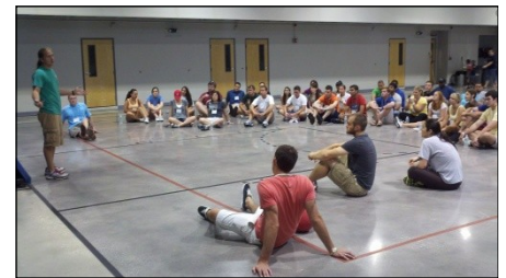
LEDC Summer Leadership program toured and volunteered in July