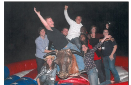
Staff at Barnyard BBQ Bash Christina Rotary Fundraiser

SAVE $ GO GREEN! Receive PSM updates via email. Send address to news@parkerstreetministries.org .