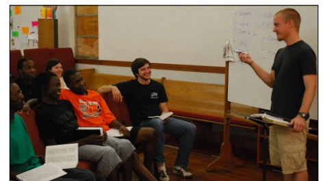
Wednesday evening Bible study