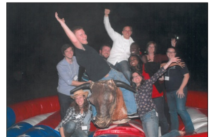
Staff at Barnyard BBQ Bash Christina Rotary Fundraiser

SAVE $ GO GREEN! Receive PSM updates via email. Send address to news@parkerstreetministries.org .