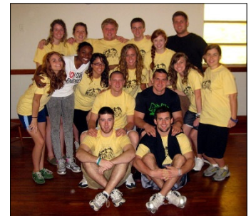
Spring Break Lakeland—His House Christian Fellowship—Mount Pleasant, MI

In March a group of college students from His House Christian Fellowship in Michigan spent their spring break in Lakeland with PSM and Lighthouse. They worked in AEP every afternoon and conducted door-to-door surveys of the neighborhood. This work enables us to create an “asset map” that helps us understand the neighborhood in terms of its assets rather than its problems... (x welders, x mechanics, x teens rather than x prostitutes, x drug dealers, etc.).