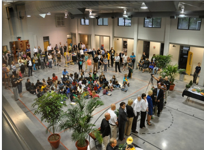
Ribbon cutting guests were amazed by the transformation.

The Spirit of the Lord is on me,...the Lord has anointed me...to bring good news to the poor, ...to bind up the brokenhearted, to proclaim liberty to the captive, to comfort all who mourn...And this is what the WORD becoming flesh and moving into our