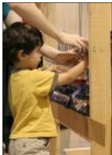
Community art at ribbon cutting

The other phases are due for completion in September 2011.