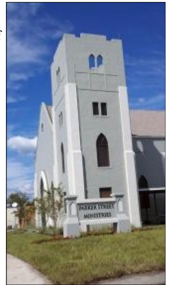
Carillon system coming soon

There will be a community celebration when we first ring the bells, so watch for the details later in 2012 . Meanwhile, share our excitement that this beautiful architectural feature will have a bell system and will serve as a community-building tool—all because of a donor's legacy of care for children and this neighborhood.