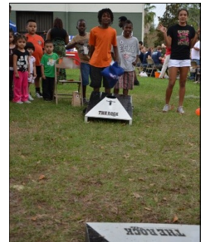
Adult Bible study members manned festival booths

Our Bible study family is made up entirely of neighborhood residents—some who are originally from the neighborhood and others who have intentionally moved in to live as Christians sharing the Gospel of Jesus through their lives. Everyone in our group had a blast running the games, helping set up, talking to neighbors, and eating some good snow cones! Being innately competitive, I had a great time competing against some of our guys in the “corn hole” game. And just for the record (and of course, not bragging!) I didn't lose a game.