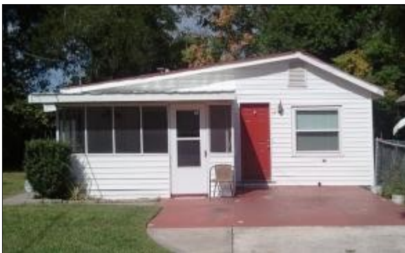
Peachtree home after repairs

One thing that quickly became evident is that when there is a neighborhood project, we need the right mix of individuals and talents to come forward to help. In the coming months, as we continue to identify projects and get better organized in our approach, we will definitely need more volunteers. These volunteers are essential to our mission, and you do not necessarily need to be skilled in a trade to lend a helping hand. If you are a tradesman or contractor looking for a charitable outlet with both materials and skills, let's grab a coffee to discuss some ideas!