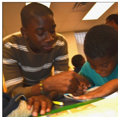
After-school tutors needed