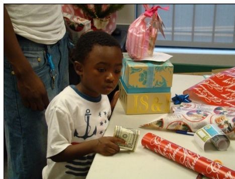
Lots of surprises await parents because of Kids' Corner

Turning a gymnasium into a fully functioning store with a registration process, brand new toys, 75% off prices, assistant shoppers, wrappers and checkout procedures is a lot of work – but it results in great joy. The Christmas Store brings together people from all walks of life – both residents and volunteers – who work together to provide a way for families to cherish their children. There is also Kids' Corner, a section of the Christmas Store that exposes the children to the infectious joy of giving.