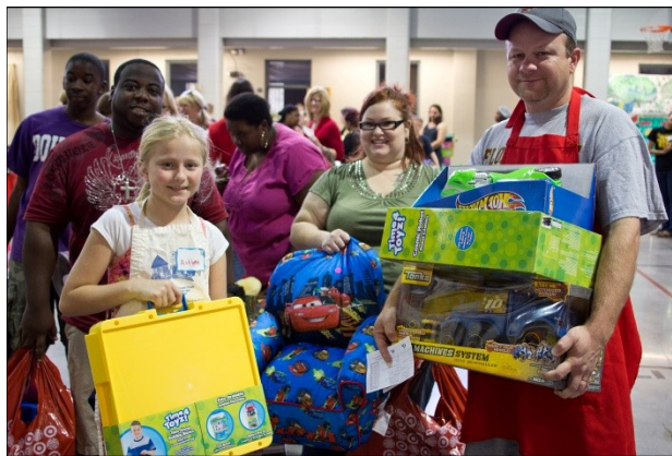
Residents and volunteer shoppers

God is a giving God, and a fruit of being created in His image is to reflect His giving nature. Most of us would agree that gifts are one of the most exciting things about Christmas. And as gift lovers, I think the majority would agree (varying results depend on age/age of heart) that it is the giving of the gifts that we truly look forward to. There is something special in showing your love by pouring energy, time, and hard-earned money into a gift – from you to them. But sometimes we become so caught up in the