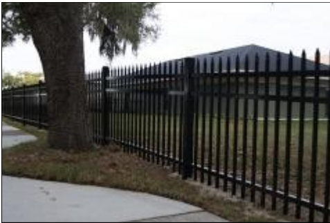
New fence protects property and children

A few months ago we finished the renovation work at PSM. There were little projects to be completed or adjusted to make the buildings better meet our needs, as is typical for any large project. Thankfully, we are quickly closing in on the facility projects which frees up more time to devote to neighborhood projects. An anonymous donor provided a quality fence around the perimeter of the office lot creating a safe, defined area for our students and for neighborhood gatherings.