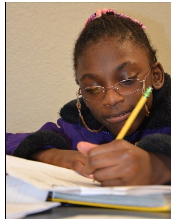
Students complete homework, then extra reading and math

Thank you for your support. I know that none of this would be possible without YOUR prayers, time and support.