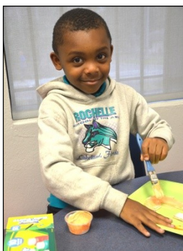
Kindergarten room is sure to make you smile

I am excited about growing our extracurricular activities this school year. Currently, Polk Museum of Art provides weekly art classes. Beginning in January, Girl Scouts of America will provide a weekly program for our elementary students. We