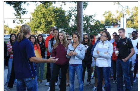
Sociology students from Florida Southern College tour PSM

It is exciting to have our offices relocated to the neighborhood. People are frequently visiting us for tours. That, in turn, is opening the doors for me to speak at churches, civic groups, and other organizations. Please pray that God is glorified by the things I say and that the hearts of the people will respond to God's call to act on behalf of our hood.